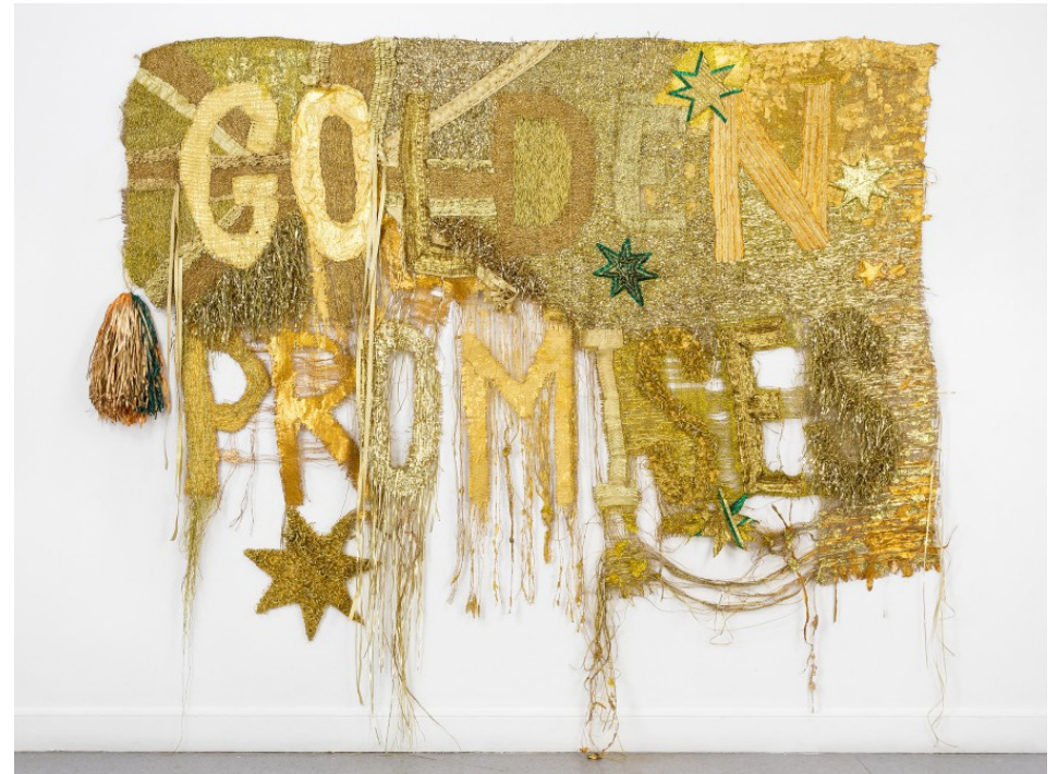
Image: Raquel Ormella, Wealth for Toil I (2014). Synthetic polymer paint, hessian, cotton, metallic thread, ribbon, 220 x 270 cm.

Exhibition Dates: Saturday 26 May – Sunday 12 August 2018