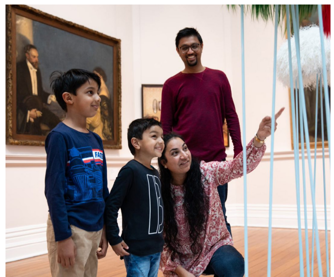
Images: 1. Cover of the Public Galleries: Our Creative Heart advocacy booklet. Design by Pidgeon Ward. 2. Visitors at the Art Gallery of Ballarat.