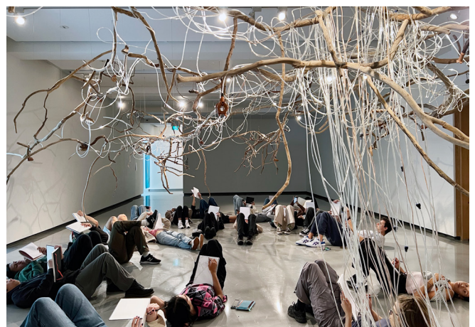
Images: 1. Celebrating First Nations at McClelland event, McClelland Sculpture Park + Gallery, May 2022. 2. Takeover at Parliament Steps 2022, Parliament Steps, Melbourne. Presented by The Social Studio, Outer Urban Projects, Youthworx in collaboration with the Australian Centre for Contemporary Art (ACCA). 3. A drawing class of MADA students in Tania Candiani's installation, Waterbirds: Migratory Sound Flow 2022 in Rivermouth, Monash University Museum of Art, Melbourne, 2023.