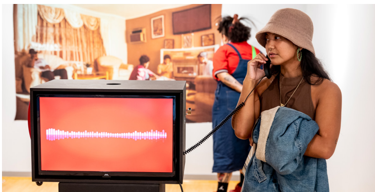
Cover image: Visitors to the BETWEEN US exhibition at Wyndham Art Gallery. Curated by Ivy Mutuku.

Digest & Highlights reach 15,436 (40% increase)