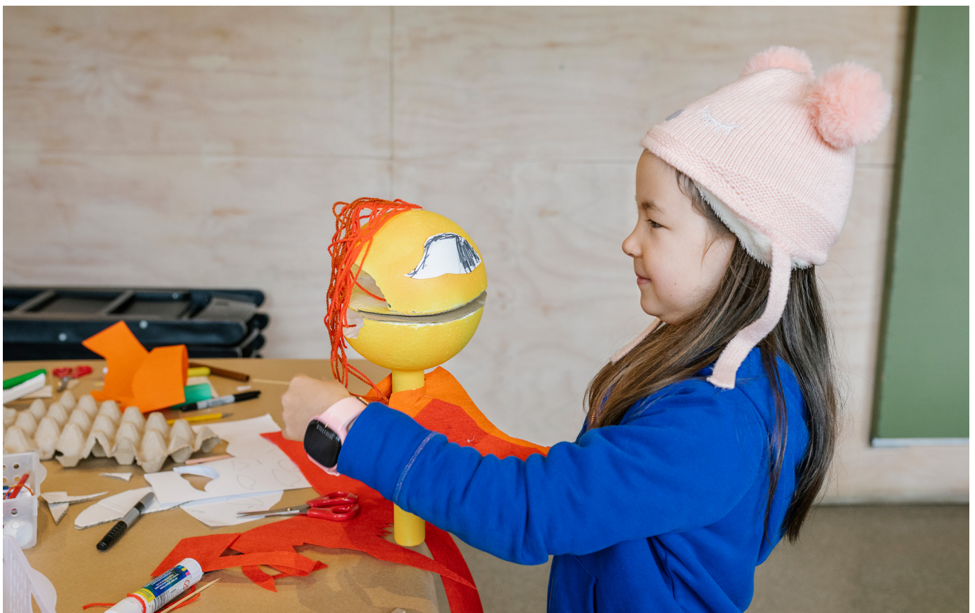
Image: Puppetmaking workshop at Heide Museum of Modern Art, 2022.

A vibrant, cohesive, professional network of public galleries across Victoria, delivering inspiring visual arts experiences that are relevant and accessible to the whole community.