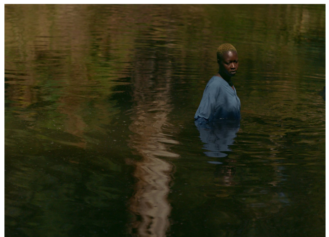
Image: 1. Atong ATEM, Water 1 (from the series BANKSIA ), 2021, digital photograph, 73x100cm. Purchased by Benalla Art Gallery with the assistance of the 2022 Robert Salzer Foundation Acquisition Fund.

A report on the VFLAA is included on page 12 of the NGV Annual Report 2021/22, available here: https://www.ngv.vic.gov.au/wp-content/uploads/2022/09/NGV-ANNUAL-REPORT-2021_22.pdf