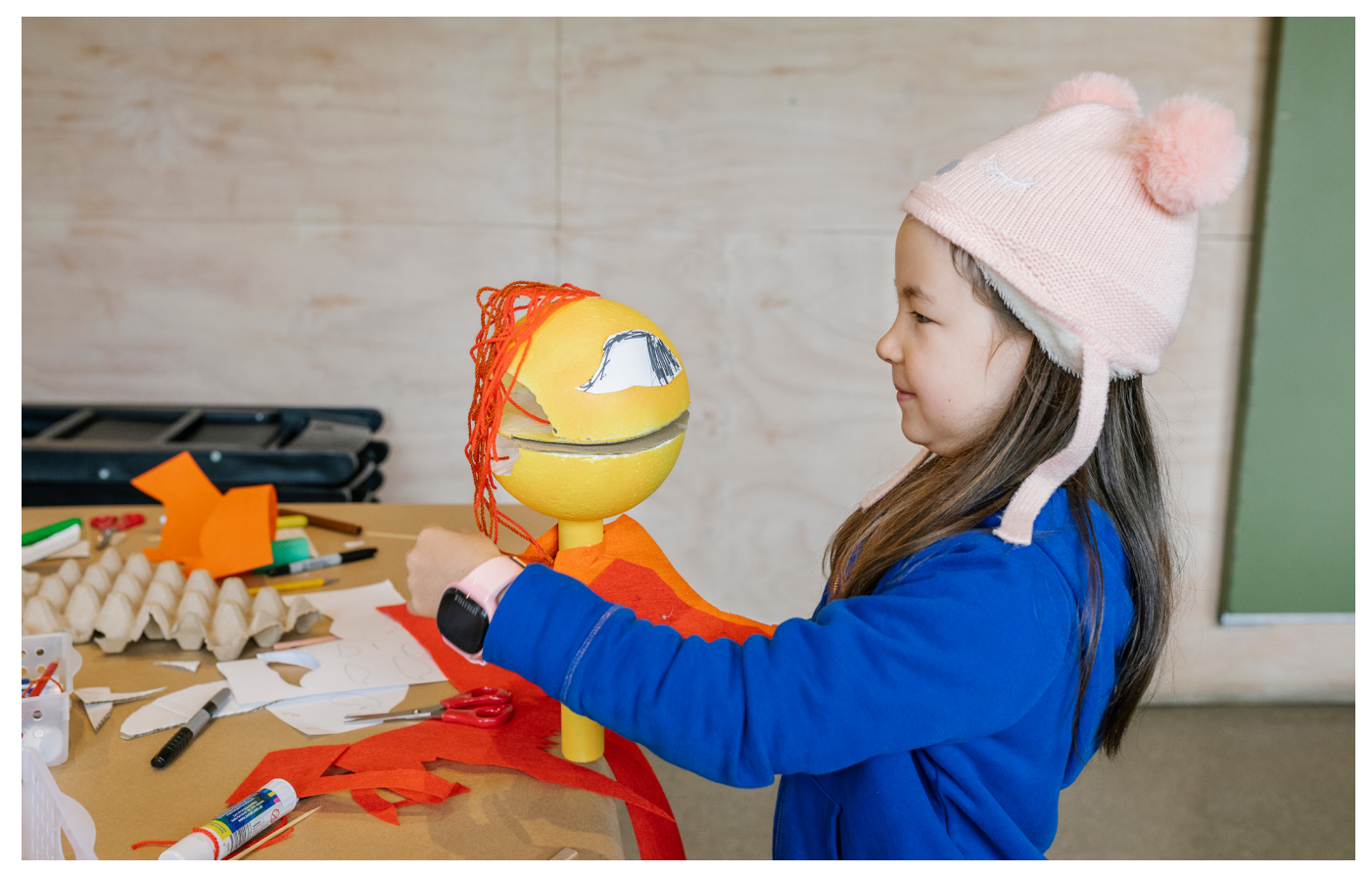
Image: Puppetmaking workshop at Heide Museum of Modern Art, 2022.

A vibrant, cohesive, professional network of public galleries across Victoria, delivering inspiring visual arts experiences that are relevant and accessible to the whole community.