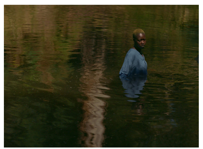
Image: 1. Atong ATEM, Water 1 (from the series BANKSIA ), 2021, digital photograph, 73x100cm. Purchased by Benalla Art Gallery with the assistance of the 2022 Robert Salzer Foundation Acquisition Fund.

A report on the VFLAA is included on page 12 of the NGV Annual Report 2021/22, available here: <u>https://www.ngv.vic.gov.au/wp-content/uploads/2022/09/NGV-ANNUAL-REPORT-2021_22.pdf</u>