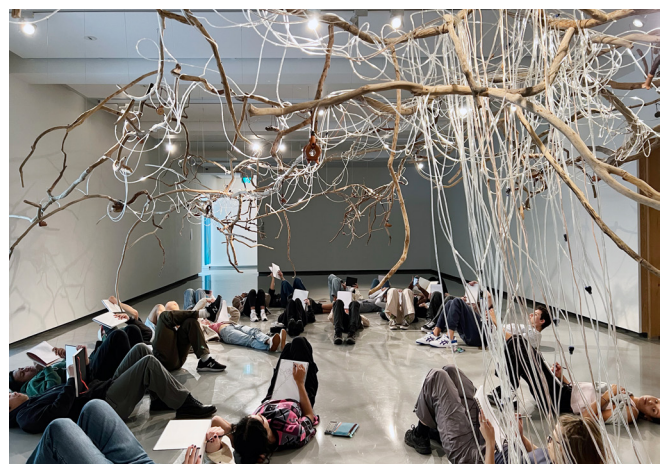
Images: 1. Celebrating First Nations at McClelland event, McClellend Sculpture Park + Gallery, May 2022. 2. Takeover at Parliament Steps 2022, Parliament Steps, Melbourne. Presented by The Social Studio, Outer Urban Projects, Youthworx in collaboration with the Australian Centre for Contemporary Art (ACCA). 3. A drawing class of MADA students in Tania Candiani's installation, Waterbirds: Migratory Sound Flow 2022 in Rivermouth, Monash University Museum of Art, Melbourne, 2023.