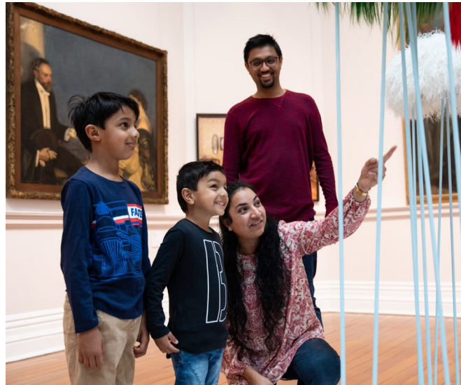
Images: 1. Cover of the Public Galleries: Our Creative Heart advocacy booklet. Design by Pidgeon Ward. 2. Visitors at the Art Gallery of Ballarat.