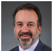
The Hon Martin Pakula MP Minister for Tourism, Sport and Major Events

We are proud of what our state has to offer, and we are delighted to present the future of tourism in Melbourne and regional Victoria.